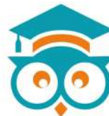
اتحاد الطلاب السوريين في كرابوك Suriyeli Öğrenciler Federasyonu - Karabük